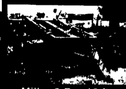
Miller 3-Bar 13 ft. Offset Disc