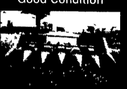
JD 643 Corn Head