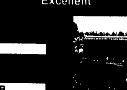
JD 8300 18x7 w/Grass Box Very Good