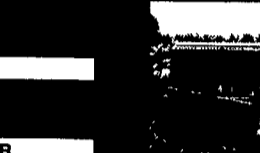
JD 8300 18x7 w/Grass Box Very Good