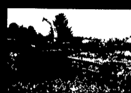
JD 3950 Harvester Excellent