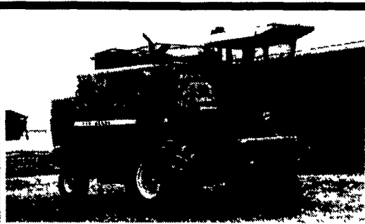
JD 7700 Turbo Combine, Hydro, Excellent Condition $7,500