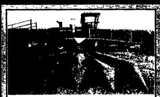
JD 4 Row Head, Rebuilt, Like New $9,000 $8,000 Also available 3-Row Head Will Trade Your Old Head - No Matter How Bad It Is 717-299-3721