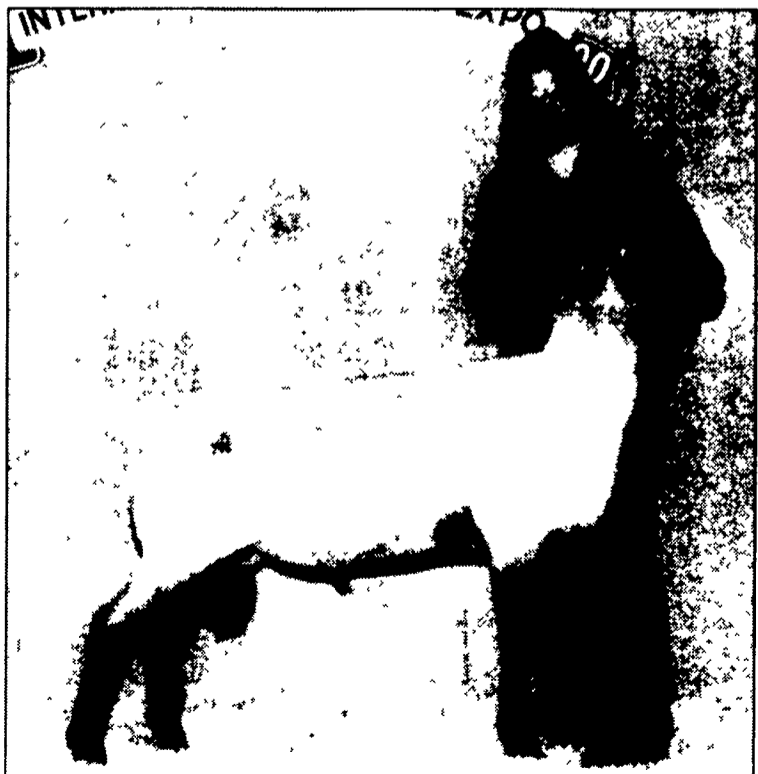
2000 Hampshire open breeding sheep reserve champion ewe, Robin Harkins.