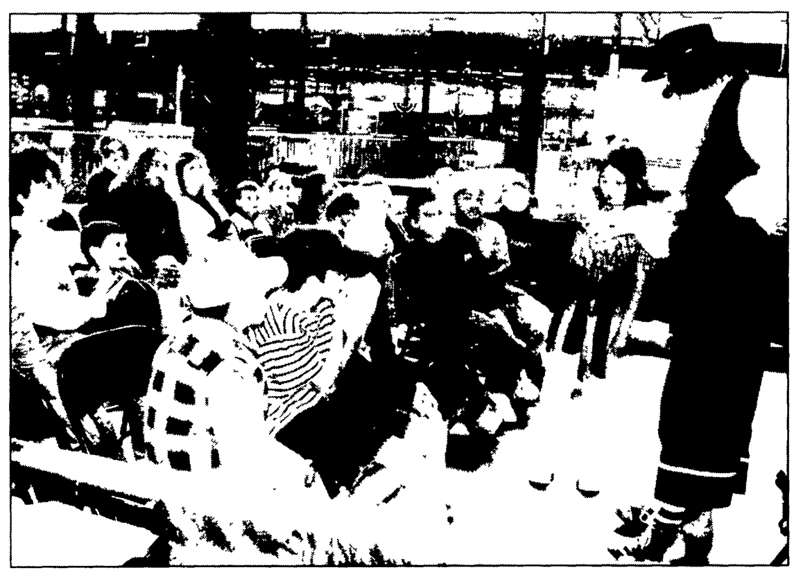
How does he do that? Kids of all ages are intrigued by the tricks BP The Clown manages to pull off.