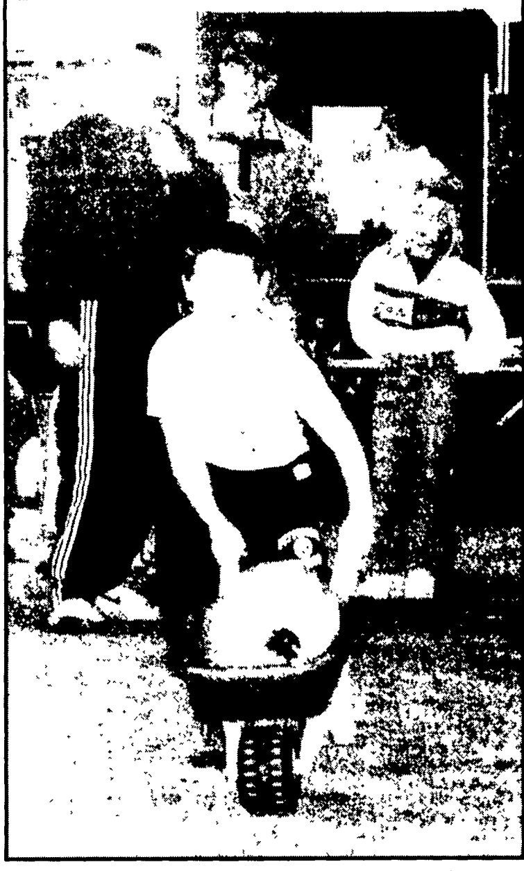
It's difficult to race while pushing a pumpkin in a wheelbarrow and rounding a corner without it tumbling to the ground.