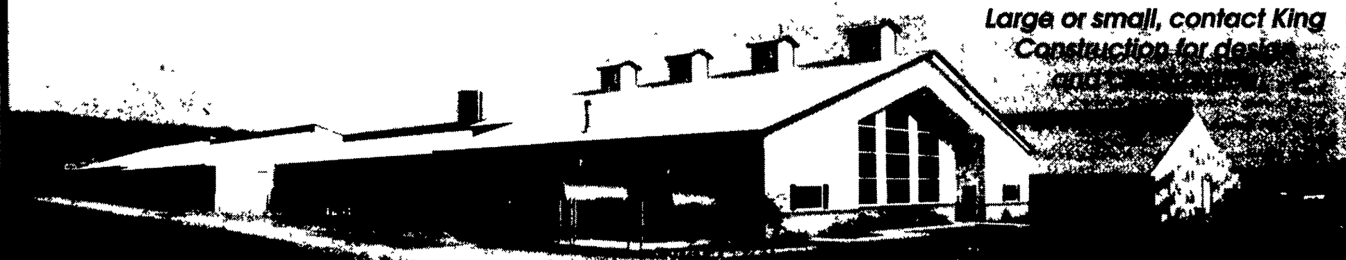
Kulp Family Dairy Farm, Martinsburg, PA, 534-Cow Freestall Barn & Milking Center

Large or small, contact King Construction for design and construction.