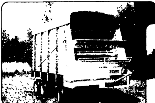
Right or Left Hand Unloading, 16 or 18 Feet. Forage Boxes

Couple this unique Pull-Type harvester design concept with a "Corn Cracker" option that loses no crop capacity running through the rolls, and you have the industry's largest capacity pull-type forage harvester.