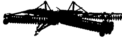
Model 1233 Tandem Disc Harrow Level Discing — We Guarantee It