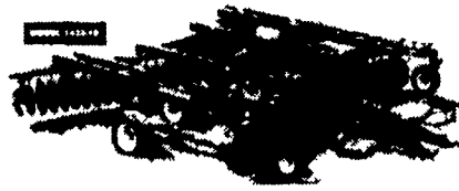
Model 1433 Tandem Disc Harrow

"We Guarantee It" Top Resale Value - Farm Auctions Prove It!