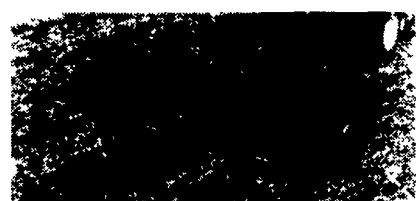
Series 5000 Field Cultivator