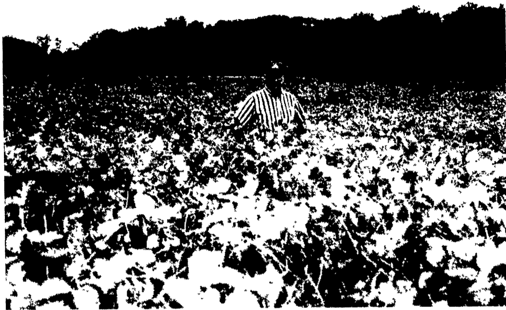
The Freedom to Farm Act of 1996 gave More the opportunity to break out of continuous corn and diversify into soybean production.