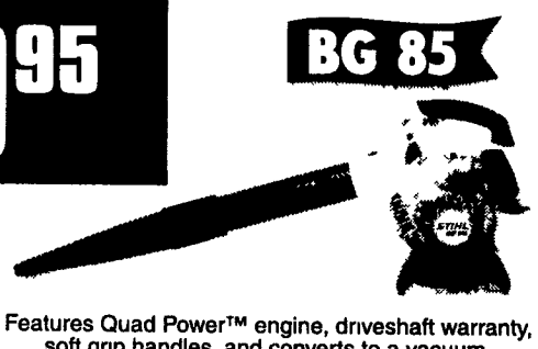
Features Quad Power™ engine, driveshaft warranty, soft grip handles, and converts to a vacuum.

Are you ready for a STIHL®? Then You're Ready To See Us! Available at these servicing dealers