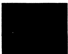
Massive 20" Auger and Forage Saw™ Knife Sections