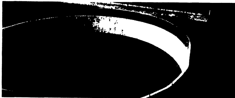
10' Deep Circular Manure Storage

Specializing In Manure Storage Round or Rectangular. In-Ground or Above-Ground