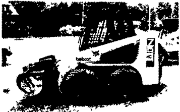
'97 Bobcat 753 Skid Loader, 1000 Hrs., 68" Dirt Bucket w/Teeth, 46HP Kubota Diesel $13,900

See Our Bobcats at the OLEY FAIR September 21, 22 & 23 See Tracy For Special Discounts