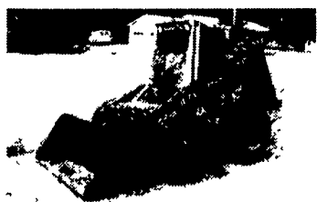
New Holland 785 Skid Loader, 66" Dirt Bucket, Nice Older Machine $10,500

Other Used Skid Loaders & Attachments In Stock!