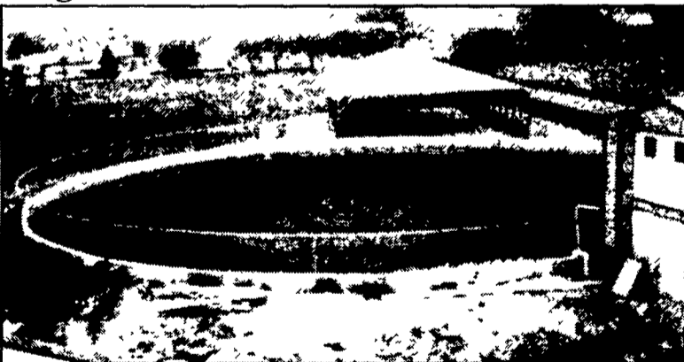
Partial In-Ground Tank Featuring Commercial Chain Link Fence (5' High - NRCS Approved)