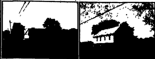
52 Acre Farm

Directions: 460 Colebrookdale Rd. Pottstown PA. From Pottstown take Rt. 100 North exit at Farmington Rd. go left on Farmington Rd. left on Evans Rd. left on Colebrookdale Rd. to farm on right and 26 acres on left. Douglas Twp., Berks Co.