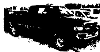
2001 DODGE RAM 2500 QUAD CAB SLT Hi-Output Cummins Turbo Diesel, 6 Spd., A/C, Most Options