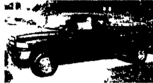
2001 DODGE RAM 3500 QUAD CAB Dually, SLT, Cummins, Turbo Diesel, 5 Spd., A/C, Most Options