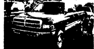
2001 DODGE RAM 2500 QUAD CAB SLT, 4x4, Hi-Output Cummins Turbo Diesel, 6 Spd., AC, Most Options

1812-1830 Paxton St., Harrisburg, PA 17104