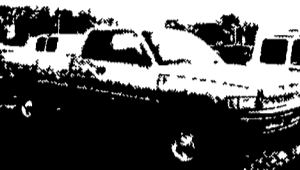
2001 DODGE RAM 2500 QUAD CAB SLT 4x4, Cummins Turbo Diesel, AT, A/C, Most Options