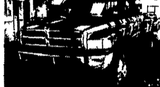
2001 DODGE RAM 3500 QUAD CAB DUALY 4x4 Cummins Turbo Diesel, AT, A/C, SLT