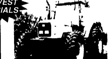
'99 White 6810, MFD, III Remotes, Buddy Seat, 540 Hrs., Loaded, Warranty $42,000