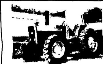
1986 MF 3545, MFD, 4200 Hrs., New Tires, V.G Cond $20,750