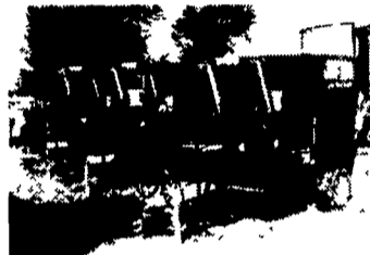
Jay-Lor "Total" TMR Mixers In Stock - Many Sizes to Choose From Special Prices - Lease Purchases Available