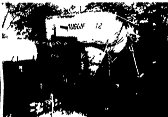
Knight 12 Big Auggie TMR Mixer w/New Scales