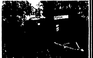
Gehl 800 Recutter w/Blower, Ideal for Hi Moisture - Corn - 4 Screens