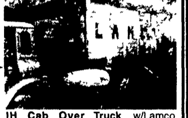
IH Cab Over Truck w/Lamco Forage Box, Runs, Needs Some Work - $1,500 As Is