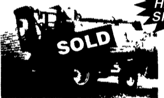
'86 CIH 1680 Standard Rotor Rock Trap, Chopper, Grain Loss Monitor Cross Flow Fan 2300 Hrs. Always Shedded, Very Good Cond $35,000