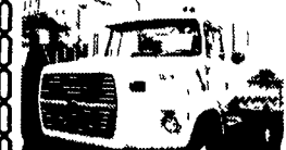
1994 Ford 19000 Tractor, GVW 34,700 Single Axle Engine N14 Cummins w/310 HP Transmission 10 Spd Manual Air Suspension Air Brakes PS & AC