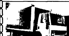
94 Ford F1 7000 5.9 Diesel 6 Speed AC PS Air Brakes 26,000 GVW Air Ride 26 Body New Tires & Brakes