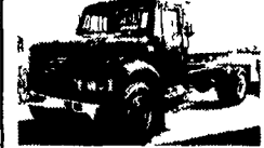
1993 International, 7.3 Diesel 5 Speed Trans PS AC Full Disc Brakes 79,000 Miles New Rubber Paint All The Bells Looks New Runs New 25,500 GVW