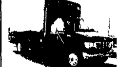
1995 Ford F350, 460 HP Gas HD Auto 14 Ft Body Roll Up Rear Dr Nice Shape 10,900 GVW