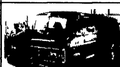
1992 Dodge Ram 150, V6 Mag Eng Auto New Brakes Tires & Shocks 75,616 Miles Excellent Like New!

Phone 717-664-1696 CHARTER ENTERPRISES, LTD. 270 Hostetter Road, Manheim, PA