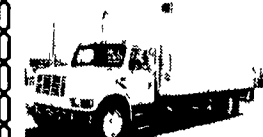
1994 International 4900, DT 466 5 Speed Trans AC PS Full Hyd Disc Brakes 11R22 5 Tires 25,500 GVW 24 Body Side Dr Lift Gate Roll Up Rear Dr