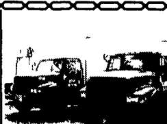
1994 International 4900, w/22 Body DT 466 Eng 190 HP 6 Speed Hyd Brakes 30,000 GVW 11R 22 5 Tires Priced To Sell!