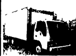
1997 Isuzu, w/16 Dry Van Body Slide Out Ramp 4 Cyl Diesel Auto AC PS 19,250 GVW 16' Rubber 104,000 Miles

Best mechanical trucks in the area plus the cleanest! We service what we sell. We offer a wide variety of dry van bodies, storage bodies and flatbeds. We also shorten & lengthen chassis to accommodate your truck body or flatbed.