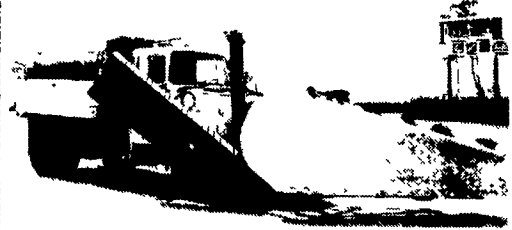
1990 FORD L900 Cummins L10, 240 HP, Jake 8LL Transmission, 18 Front, 30 Rear, 9' Dump Box Plow, Wing, Drop in Spreader