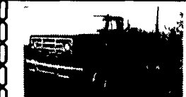
1984 GMC 7000, 366 V8 Gas 542 Spd Trans Hyd Brakes New Paint Color Red 28,000 GVW 108,184 Original Miles New Tires New Service New Brakes PA State Insp