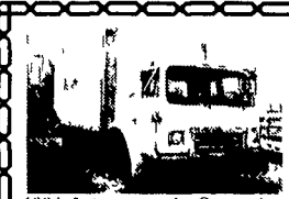
1984 International, Cargo Stu w/16 Dry Van Body Roll Up Rear Door 7.3 Diesel Auto Hyd Brakes 20 Rubber 22 5000 GVW 192,000 Miles