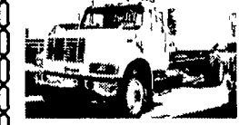
1994 International Cab & Chassis DT 466 210 HP Eng 6 Speed Trans AC PS Full Air Brakes Looks New & Runs New 35,000 GVW