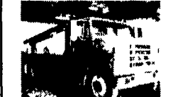
1982 International F2275, Conv Cab 671 Detroit Diesel 10 Speed Road Ranger Trans Henderson Susp 11R24 5 Tires Budd Wheels PS PFO & Wet Line 53,000# GVW Low Miles Good Farm Truck!