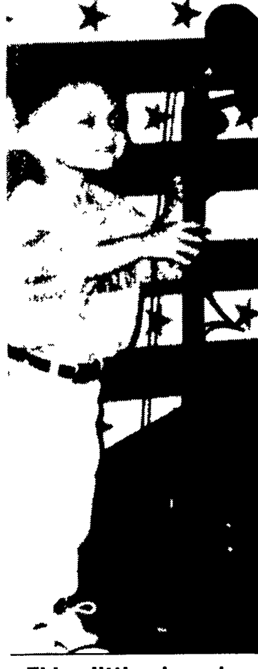
This little boy has rhythm and wants the microphone.