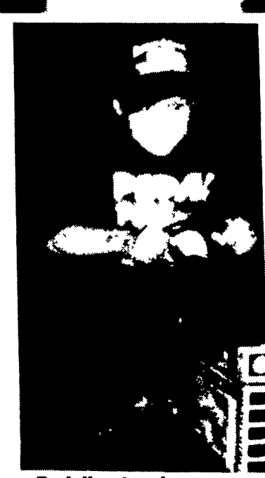
Pedaling to win.

By then, instead of going to the moon or Mars, most kids decided for their own beds, which pleased their parents.