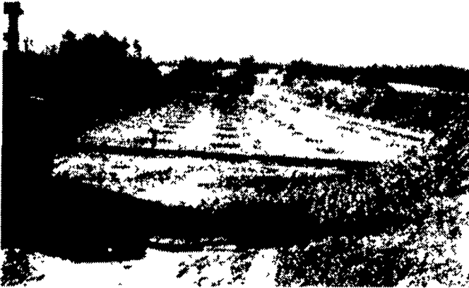
New Reinforced Concrete Manure Containment Structures

Our agricultural engineering services include the design of livestock confinement housing, farmstead planning, manure handling systems, ventilation and mechanical design. Today's agricultural building systems must be designed to provide the highest amount of production capable per square foot of building cost. An engineer design will help you optimize your next building project.