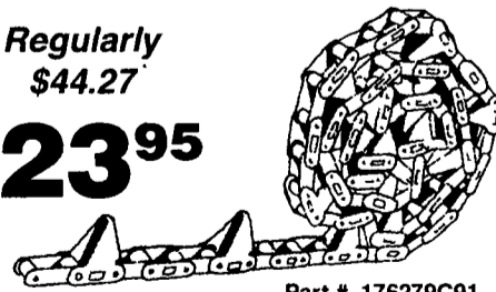
Part # 176279C91

Fits Case IH 800, 900, 1000 Series Corn Head, many John Deere applications, and New Holland machines - all models from 1980.