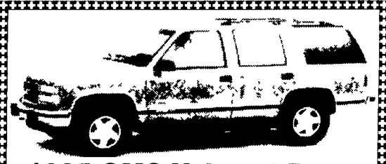
1995 GMC Yukon 4 Door, 4x4 Sandlewood Ext. & Beige Int. 181,000 Mile, Clean, Strong & Sound $9,995.00 (610) 796-2268