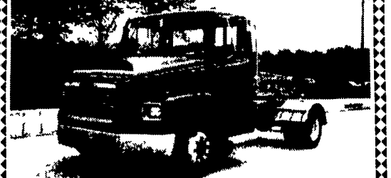
1994 FREIGHTLINER FL-60 TRACTOR S/A Day Cab, Cummins 190 HP, 5 SPD Transmission, Cloth Interior, Cold A/C $17,950 Jake's Truck Shop Inc. 888-285-9301