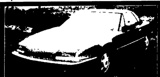
'88 BUICK REATTA SPORTS CAR, All Options, 1st Year Made, Touch Screen Computer, Auto, 160,000 Mi. • $6,000 OBO • (215) 536-9239