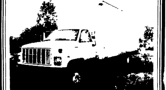
1992 GMC Topkick LoPro, 23,900 lb. GVW, 24 ft Morgan Box, 366 V8, 4-Spd Allison, AT, A/C, 140,000 Miles, New Brakes and Tires, Runs Excellent, Looks Good $10,900 717-361-9296