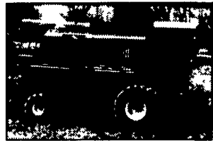
C 30220 1982 IH 1460 2WD, 4125 Hours, Specialty Rotor, Grain Loss Monitor, Auto Header Control, Tires: Drive - 28L x 26, Steering - 18.4 x 16.1