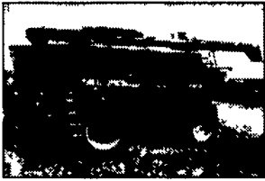
B 17357 1997 CIH 2188 4WD, 916 Hours, Specialty Rotor, Chopper, Rock Trap, Chaff Spreader, Tires: Drive - 30.5L x 32, Steering - 18.4 x 26