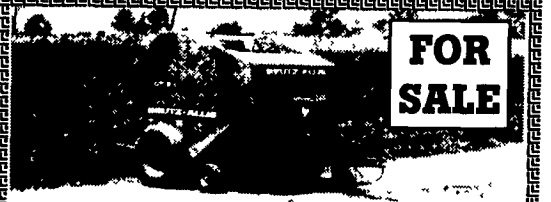
Deutz-Allis GP 2.30 Round Baler, Excellent Condition....$4,000 OBO Also - MC 9ft. Stalk Shredder...$1,000 OBO (717) 597-4521