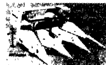
For row crop applications, the new three-row 3PN features new spacing from 28" to 32"