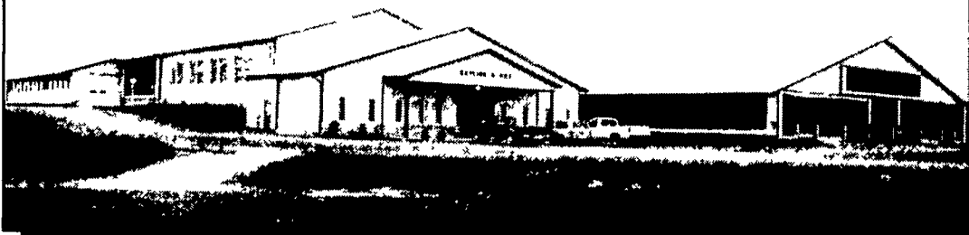
Skyline Acres Farm, Bernville, PA

450 Cow Freestall Barn & Milking Center with Holding Pen and Special Needs Area.