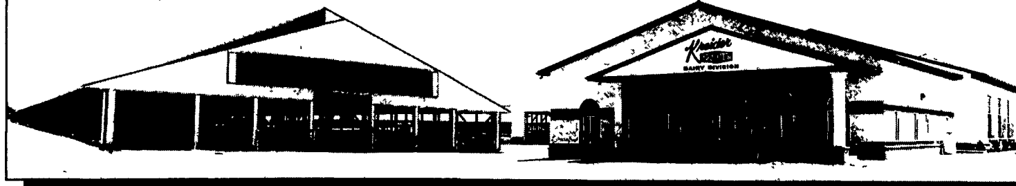
Kreider Farms, Manheim, PA

122' x 516' 560-Cow Freestall Barn with 14' high sidewalls and 52' x 276' Milking Center