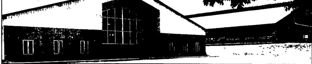
Frosty Hollow Farms, Woodbury, PA

112' x 360' x 14' 450-Cow Freestall Barn & Milking Center with 72' x 132' Special Needs Barn.