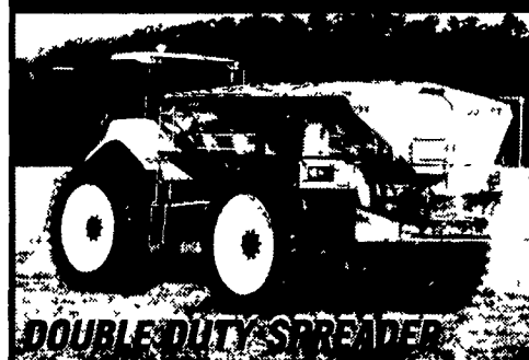
DOUBLE DUTY SPREADER

10577 31st 10577 31st 10577 31st 10577 31st 10577 31st