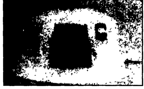
Large Poly Dome Calf Nursery (Translucent) Great Winter Hutch.