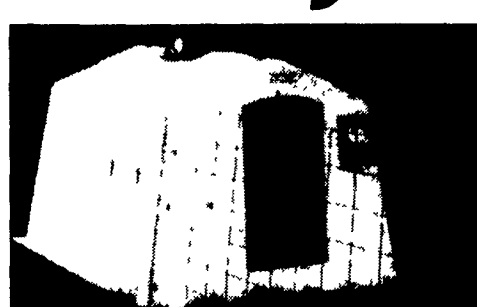
Poly Square Big Foot Calf Nursery (Opaque) 5 1/2'x8'.