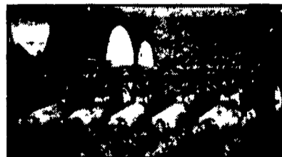
Redball Cultivating Sprayer One Pass Operation. Save Time, Fuel and Herbicide