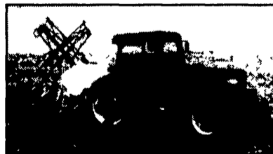
Three-Point Hitch Sprayer Front-Mount and Side-Mount Also Available

Visit Us At Empire Farm Days Aug. 8, 9, 10 and Ag Progress Days Aug. 15, 16, 17 6,000 PRODUCTS FROM OVER 200 MANUFACTURERS