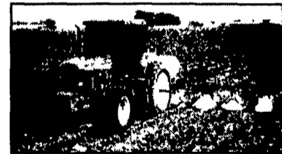
Lay-By Spray-Hood Achieve Accurate Directed Spray Applications in Roundup® Ready Crop