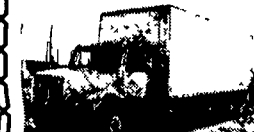
1994 International 4900, DT 466 5 Speed Trans AC PS Full Hyd Disc Brakes 11R22.5 Tires 25,500 GVW 24 Body Side Dr Lift Gate Roll Up Rear Dr