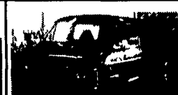
1992 Dodge Ram 150, V-6 Mag Eng Auto, New Brakes Tires & Shocks 75,616 Miles Excellent Like New!

Phone 717-664-1696 CHARTER ENTERPRISES, LTD. 270 Hostetter Road, Manheim, PA