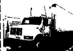
1995 International 4900, w/24 Morgan Van Body DT 466 Eng Auto AC PS New Tires Ex Cond 32,800 GVW