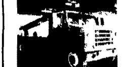
1982 International F2275, Conv Cab, 671 Detroit Diesel 10 Speed Road Ranger Trans Henderson Susp 11R24.5 Tires Budd Wheels PS PTO & Wet Line 53,000# GVW Low Miles, Good Farm Truck!