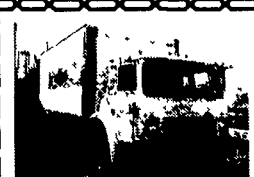
1984 International, Cargo Star w/16 Dry Van Body Roll Up Rear Door 7.3 Diesel Auto Hyd Brakes 20 Rubber 22 5000 GVW 192,000 Miles