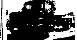
1993 International, 7.3 Diesel 5 Speed Trans PS AC Full Disc Brakes 79,000 Miles New Rubber Paint All The Bells Looks New Runs New 25,500 GVW