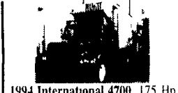
1994 International 4700, 175 Hp DT 408 Diesel 5 Speed Trans Full Disc Brakes Budd Wheels 22.5 Rubber PS AC 25,500# GVW 14 Supreme Reeler Body Folding Rear Drs Thermo King MD11 Unit Clean Truck!