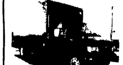
1995 Ford E350, 460 HP Gas H D Auto 14 Ft Body Roll Up Rear Dr Nice Shape 10,900 GVW