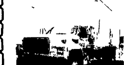
1994 Ford 700, w/18 Morgan Van Roll Up Rear Door 5.9 Cummins Diesel 175 HP 4 Speed Auto Trans AC PS Hyd Brakes 76,000 GVW, White