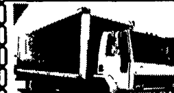
94 Ford CF 7000, 5.9 Diesel 6 Speed AC PS Air Brakes 26,000 GVW Air Ride 26 Body New Tires & Brakes