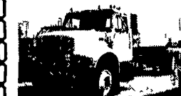
1994 International, Cab & Chassis DT 466 210 HP Eng 6 Speed Trans AC PS Full Air Brakes Looks New & Runs New! 33,000 GVW