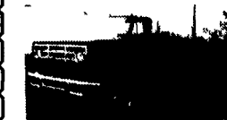
1984 GMC 7000, 366 V8 Gas 542 spd Trans Hyd Brakes New Paint Color Red 28,000 GVW 108,184 Original Miles New Tincup New Service New Tires New Brakes PA State Insp

Best mechanical trucks in the area, plus the cleanest! We service what we sell. We offer a wide variety of dry van bodies, storage bodies and flatbeds. We also shorten & lengthen chassis to accommodate your truck body or flatbed.