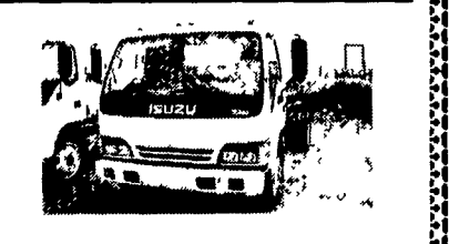
New 1999 Isuzu NPR; 16 500 GVW, 175 HP, Auto Air, Stereo BLOWOUT PRICE Call Keith