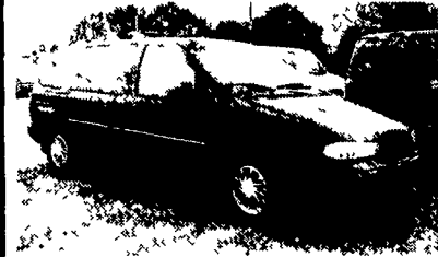
98 FORD WINDSTAR GL 7 Passenger 3.8 V6, Dual A/C & Heat, Privacy Glass, Tilt, Cruise, PW, PL Keyless, Cassette, Quad Captains, Black, 32K Mi. #3485