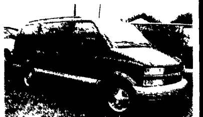
98 Chevy Astro LT, 7 Passenger, 4.3 V6, Dual A/C & Heat, Privacy Glass, Tilt, Cruise, PW, PL, Pseat, Cassette, CD, Green & Silver, 10K Mi. #3496