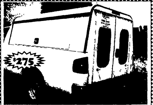
Utility Topper for Chevy S10 Pickup Longbed, Fits 1994 On M.M. Weaver & Sons 717-656-2321

1980 Peterbilt 359 Daycab, 400 Cummins w/lake brake, 15 sp. wetline, aluminum wheels, 1973 Gilmore aluminum dump trailer, 28' roll tarp, coal chute $18,500. (610)286-6356.