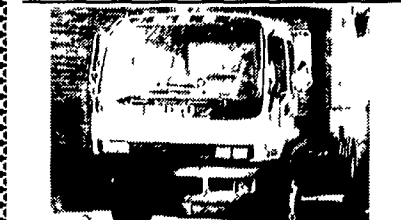
2000 ISUZU FTR, 200 HP Diesel 6 Spd., 25950 GVW Lots of Options, Set up for 24 Ft Body or Will Change Wheelbase