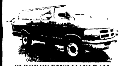
99 DODGE B3500 MAXI RAM WAGON, 15 Passenger, 5.4 Magnum V8, Dual A/C & Heat, Privacy Glass, Tilt, Cruise, PW, PL, Keyless, P Mirrors, Cassette, Rear Step Bumper, Burgundy, 30K Mi., #3481