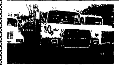
1990 FORD LN 7000, 6.6L 185 HP Diesel 6-Spd, 30,000 GVW, 16' Stake Body, 257,000 Miles