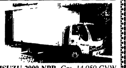
ISUZU 2000 NPR, Gas, 14,050 GVW, 250 HP, V8 Engine, Auto Trans., A/C, AM/FM Cass., 14' Van Body GREAT PRICE OR LEASE!