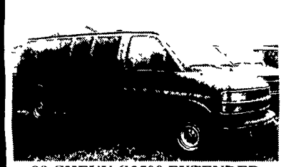
99 CHEVY G3500 EXTENDED EXPRESS LS, 15 Passenger, 5.7 V8, Dual A/C & Heat, Privacy Glass, Tilt, Cruise, PW, PL, P Mirrors, Cassette, Blue, 35K Mi., #3475