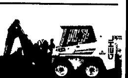
GEHL 4835 Skid Steer Loader, 57HP Turbo w/9' Backhoe, Rental Return, Reduced, Call for Details & Finance Options