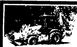
96 Case 580 Super L Cab, 4WD, Extend-a-hoe $39,900 $37,900

CASE III CASE III Visit us on the Internet at http://www.casecorp.com