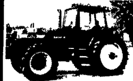
98 Magnum 8920 MFD, Low Hours, 155 HP, 18 4x42 6.9% Financing