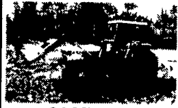
CASE 1394 60HP, 16 Speed Synchronesh, 4 Post w/Canopy, Loader w/Bucket, Only $11,000 & Waiver of Interest to 1-1-2001