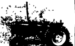
JD 2350 56 HP, 8 Speed, 16 9x30 tires, one set remotes