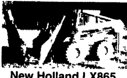
New Holland LX865 Turbo With Red Boss 42" Spade (Very Low Hours)