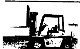
1991 CAT FORKLIFT 480F 6800 lb Rating, 14' 3-stage mast $15,900