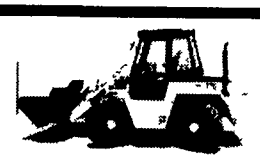
Kramer 720 Wheel Loader (Rental Return) 106 Hp, 1.9 Cu Yd Bucket, All Wheel Steer