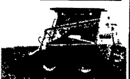
1996 CASE 1845C Unloader Cab w/Heater, Hi Flow Hydraulics $18,900