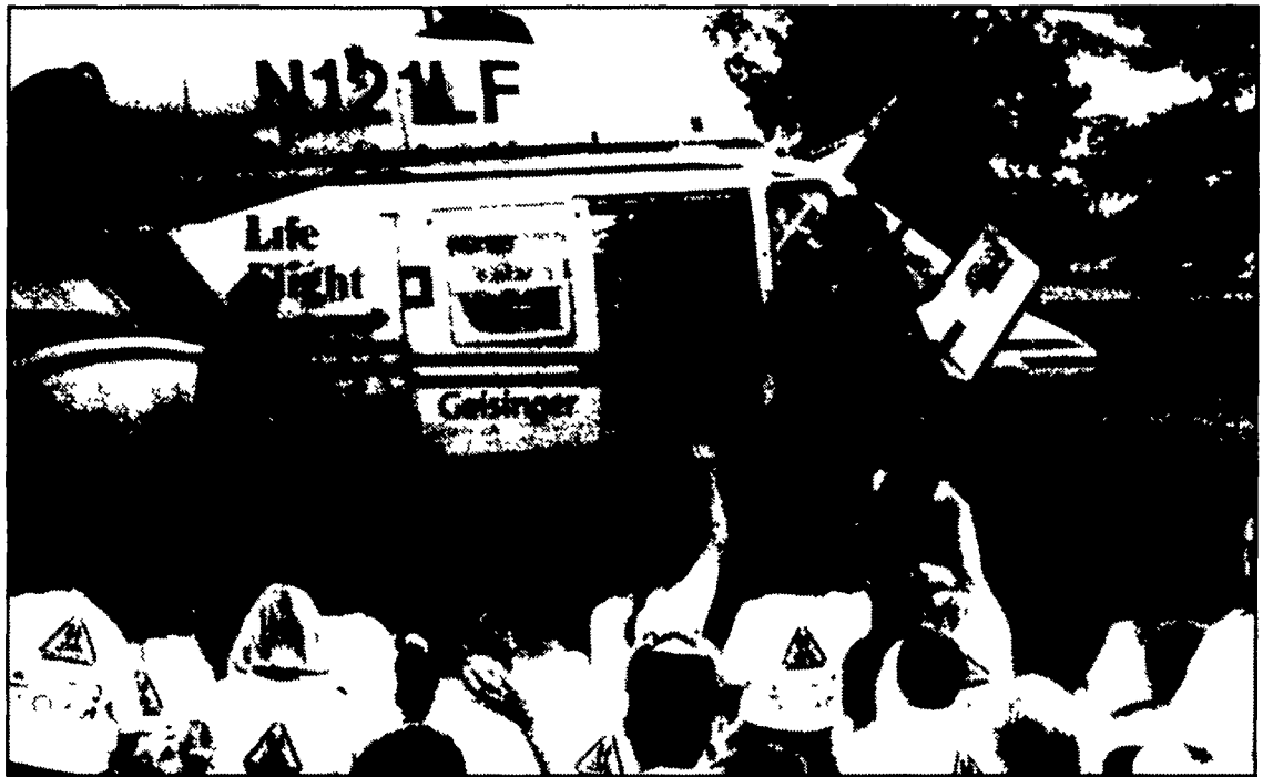
The West Snyder FFA and Progressive Farmer Magazine Farm Safety Day Camp was host to a public relations presentation by Life Flight from Geisinger Medical Center. Camp participants were able to ask questions about the use of Life Flight and see what takes place aboard the helicopter.