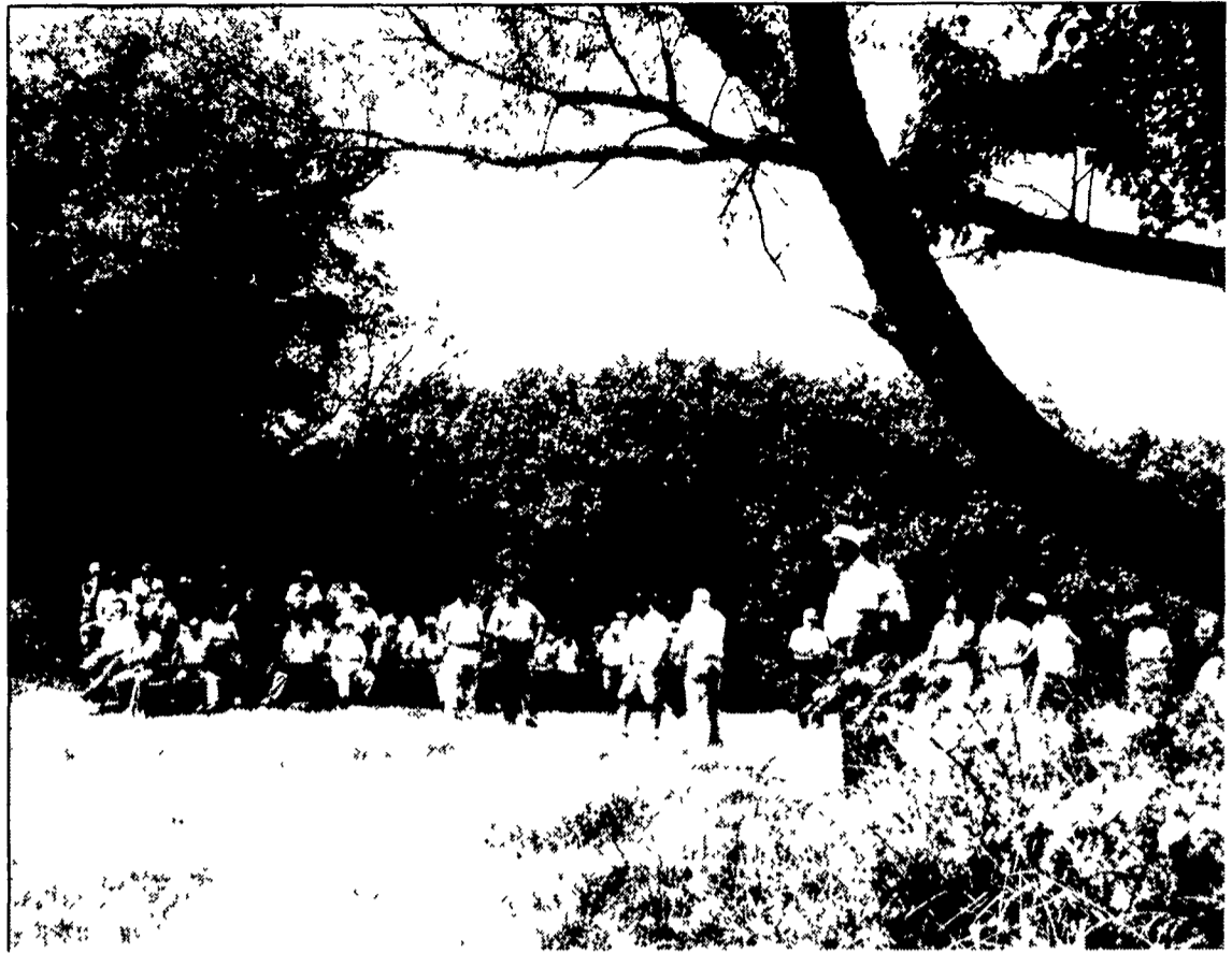
Part of the crowd of farmers and agribusiness people attending Ag Showcase Day at the Cecil County Fair.