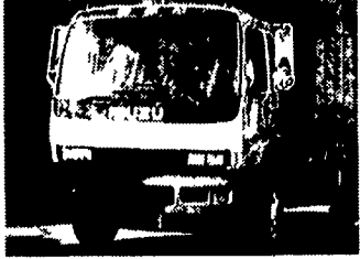
2000 ISUZU FTR, 200 HP Diesel, 6 Spd., 25950 GVW, Lots of Options, Set up for 24 Ft. Body or Will Change Wheelbase