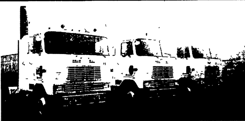
(3) 1992 International 9620

N14 370 H P, 9 Speed, PS, AC, Air Ride Susps., 22 5 Rubber, Steel Disc Wheels, $8,900 Each