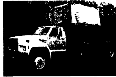
1991 Ford F800

N14 370, 9 Speed, Air Ride Susp., P/S, A/C, 22 5 Rubber, Good Miles $11,900