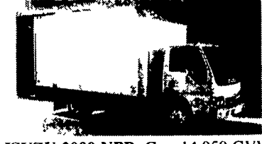
ISUZU 2000 NPR, Gas, 14,050 GVW, 250 HP, V8 Engine, Auto Trans., A/C, AM/FM Cass., 14' Van Body.. GREAT PRICE OR LEASE!