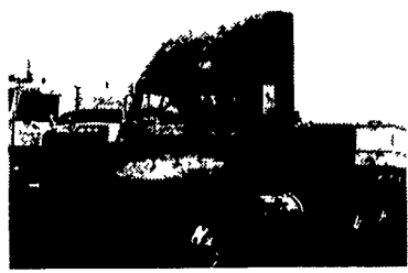
(1) 1991 CH613 Mack

N14-350, 10 Speed, Air Ride Susp., P/S, A/C, 22 5 Rubber, 48" Sleeper $21,000