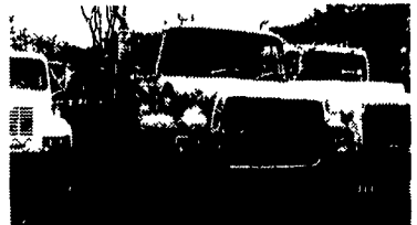
1990 FORD LN 7000, 6 6L 185 HP Diesel, 6-Spd, 30,000 GVW, 16' Stake Body, 257,000 Miles