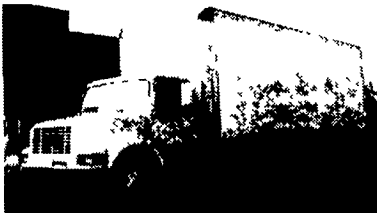
1996 INTERNATIONAL 4700, DT466, 175 HP, 5 Spd., 25,500 GVW, 24 Ft Van Body 5 Spd or AT, LOW MILES.