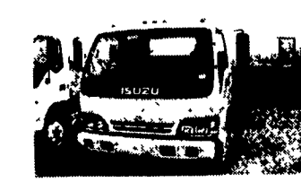
New 1999 Isuzu NQR; 16,500 GVW, 175 HP, Auto, Air, Stereo BLOWOUT PRICE Call Keith