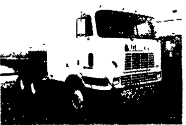
1994 Int'l 9700

350 HP, Eng Brake, P/S, A/C, Air Ride Susps., (10) Alum. Wheels $15,900