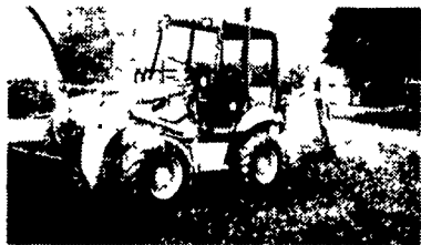
93 JCB 210S TLB, 2300 Hrs., 3 Buckets.....$18,500