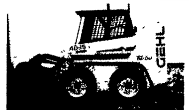
1999 Gehl 4835, 287 Hrs., w/Grapple Bucket or Regular Bucket...$14,750