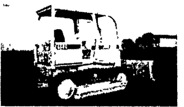
94 John Deere 650G with 6-Way, 80% UC.....$42,000