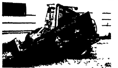
94 NH 785 Skid Loader, Ford Dsl.....$9,900