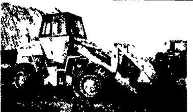
Case W20B, Good Rubber...$15,500