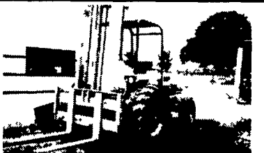
MF 2500 Forklift, Dsl.....$8,500