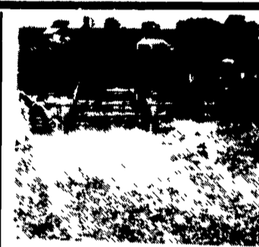
Tandem Hay Rake Hitch