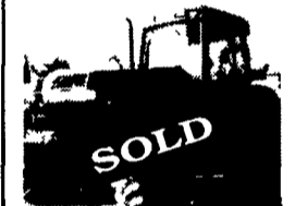
Case IH 7140 Magnum Tractor, 1900 Hrs., Very Nice.....(O)