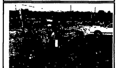
Kubota B1750 4x4, Loader, Hydro $10,500 $9,500