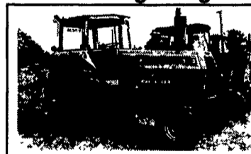
White 2-180 w/Cab, 180 hp, Cold AC, 3000 Hrs. - $16,500

Route 194 and Brown Road 410-751-1500 Bush Hog® King Cutter Toll Free 877/751-1500