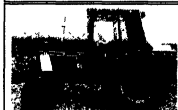
Int. 1486 w/Cab, Runs Good $6,495