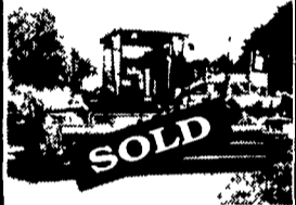
Case IH 8840 Windrower, w/14' Head, 1994, 417 Hrs., Excellent Condition.....(O)