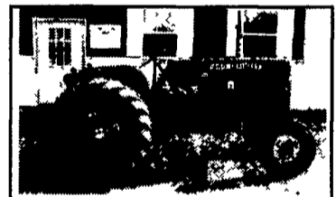
AC D14, Factory Snap Coupler 3pt, Very Straight - $2,995