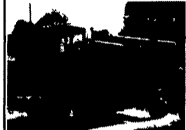
Case IH 1666, 1993, 1,230 Hrs., Very Nice..(O)