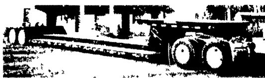
New "2000" Landoll 323AG-48 Detachable 35 Ton Air Ride, 28x102" Drop Side with 24" Pull-Out Side Extensions, Self-Contained.