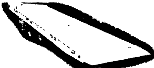
2000 Trail-Eze 20 & 25 Ton Heavy Duty Tilt Deck Trailer, Pintle Hitch, Air Brakes, In Stock Now!!