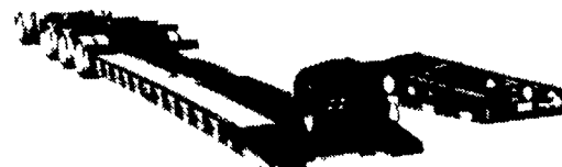
New Fontaine Specialized 35, 50 & 55 Ton Detachable Gooseneck. Many Options Available. Call For Your Best Price.