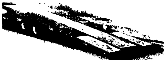
2000 Trail-Eze 20 Ton Sliding Axle - Tilt Deck Trailer, Pintle Hitch Trailer. 30' Deck, Air Brakes, In Stock!!