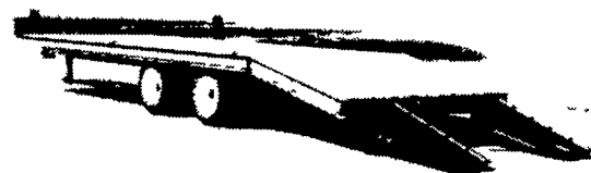
2000 Trail-Eze 10 Ton Ramp Trailer, 24' Deck (19' Flat + 5' Beavertail), Electric Brakes, Pintle Hitch, In Stock!