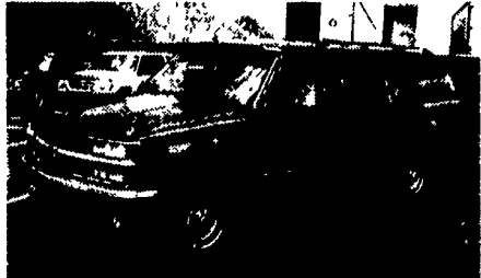
1999 CHEVROLET SUBURBAN 2500 4x4, 454 V8, AT, Dual A/C, Most Options, Tow Pkg., 16,000 Miles $30,995

Outten Hamburg Rt. 61, Hamburg PA 1-800-451-2333 • 610-562-2216