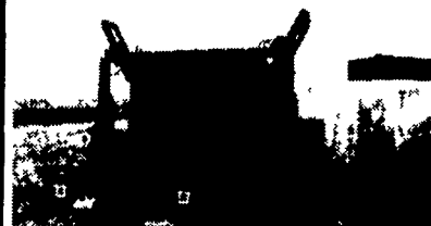
Square Bale Tuber