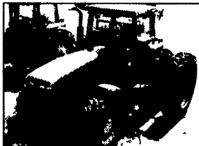
B 19590 1996 JD 8400 MFD Cab, 2386 Hours, 18.4x46 Duals, 225 HP

Call a Hooper Salesman Today For Details Financing Options Available to Change Without Notice