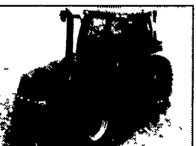
A 22784 1999 CIH MX 200 MFD Cab, 513 Hrs, 18.4x42 Duals, 165 HP