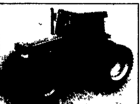
A 23043 1990 CIH 7130 MFD Cab, 7279 Hrs, 18.4 R 42 Duals, 172 HP