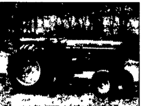
C 31016 1973 JD 4430 2WD, 5980 Hrs, 20 8x38 Rear Tires, 125 HP