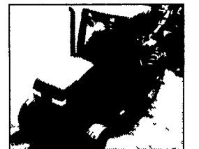
B 19582 1991 CIH 7120 2WD Cab, 3093 Hrs, 18.4x46 Rear Tires, 151 HP