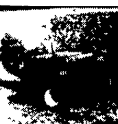
C 31177 IH 435 E With Thrower, 14' WAS $3,200, IS $2,000