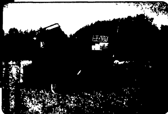
540 or 1000 RPM High Capacity Blowers