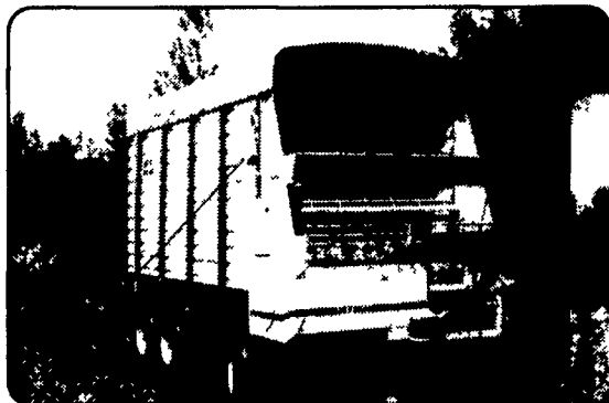
Right or Left Hand Unloading. 16 or 18 Feet. Forage Boxes

Couple this unique Pull-Type harvester design concept with a "Corn Cracker" option that loses no crop capacity running through the rolls, and you have capacity equal to or better than many self propelled harvesters.