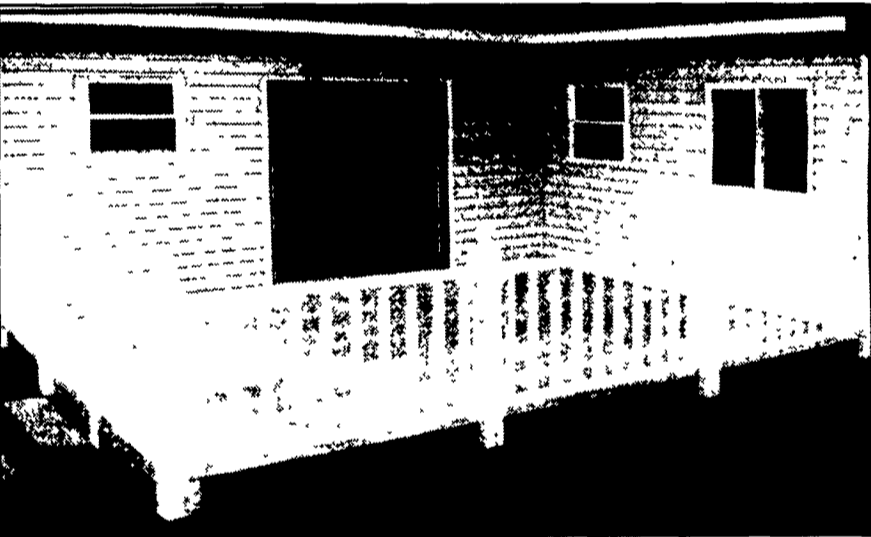
• Deluxe handrail brackets slide over rails and attach to posts with screws

BALUSTER 99¢ 2" x 2" -32"... #100880 BALL TOP $3 19 #656011... HANDRAIL BRACKET $4 19