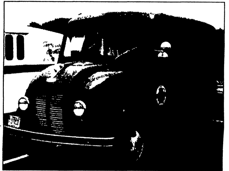
One of the 30 Divco trucks on display at the collector's convention. They came from as far away as Florida and Canada.