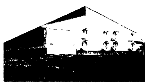
Free Stall Barn, Robesonia, PA