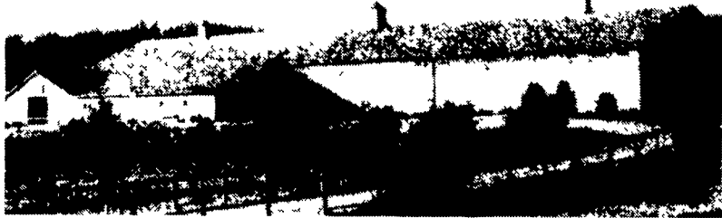
72 x 180 Indoor Arena with 20 Stall Barn

139 Churchtown Rd., Narvon, PA 17555 (717) 768-8606 (717) 768-3264 FAX