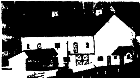
48 x 72 Bank Barn

Whether your need may be a small barn or a large equestrian center, give us a call and let our experience work for you