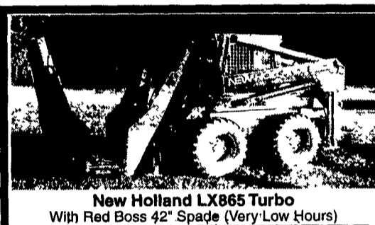
New Holland LX865 Turbo With Red Boss 42" Spade (Very Low Hours)