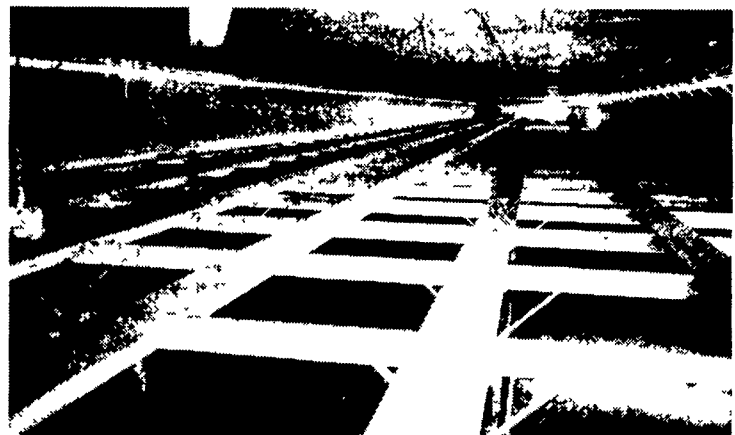
Removal of all existing girders and walkway. Install all new laminated girders and walkway. Cut open sidewall to enlarge inlet openings.