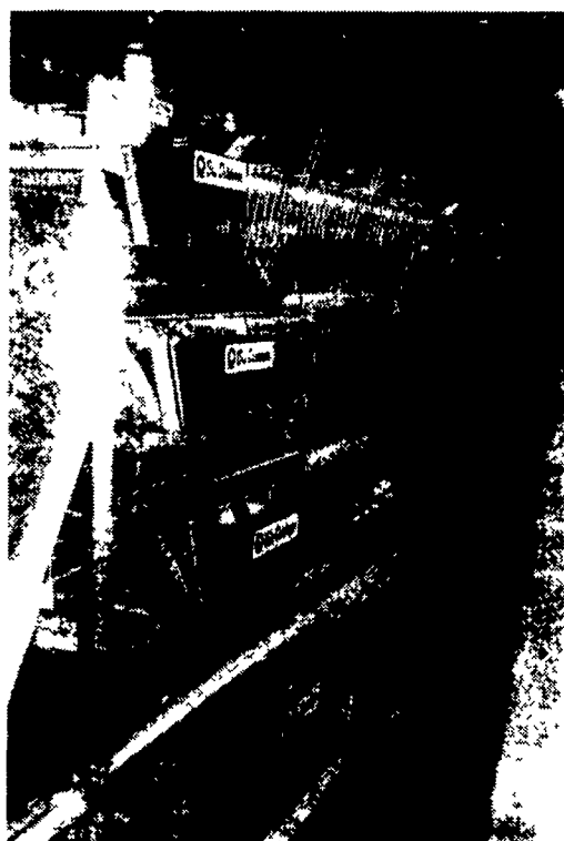
Big Dutchman Champion Feeding System.

Big Dutchman 4 tier double-dipped galvanized cage bottom with 2 extra wires for saving birds and egg roll out.