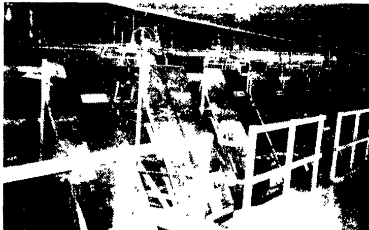
Big Dutchman 420N Grows 500' Long. Big Dutchman rubber finger collectors. Big Dutchman 18" PVC rod conveyor.