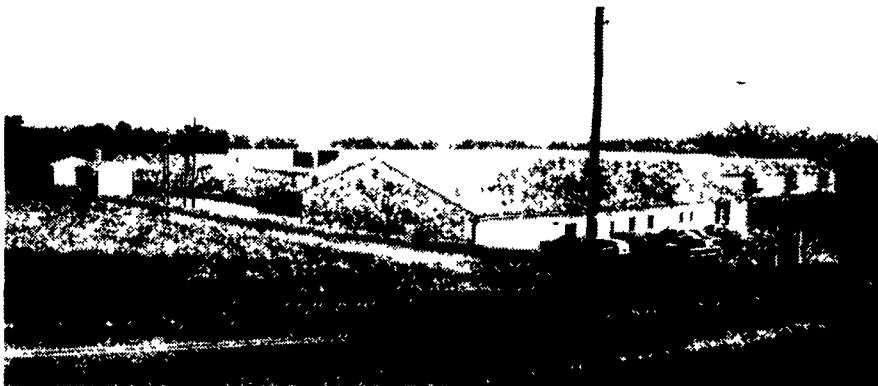
EGG BASKET FARM. Four 20+ year old layer building and egg room.