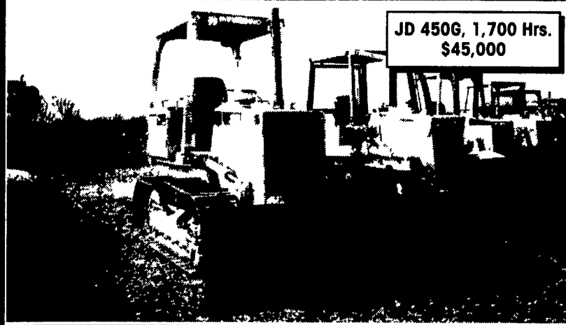
JD 450G, 1,700 Hrs. $45,000