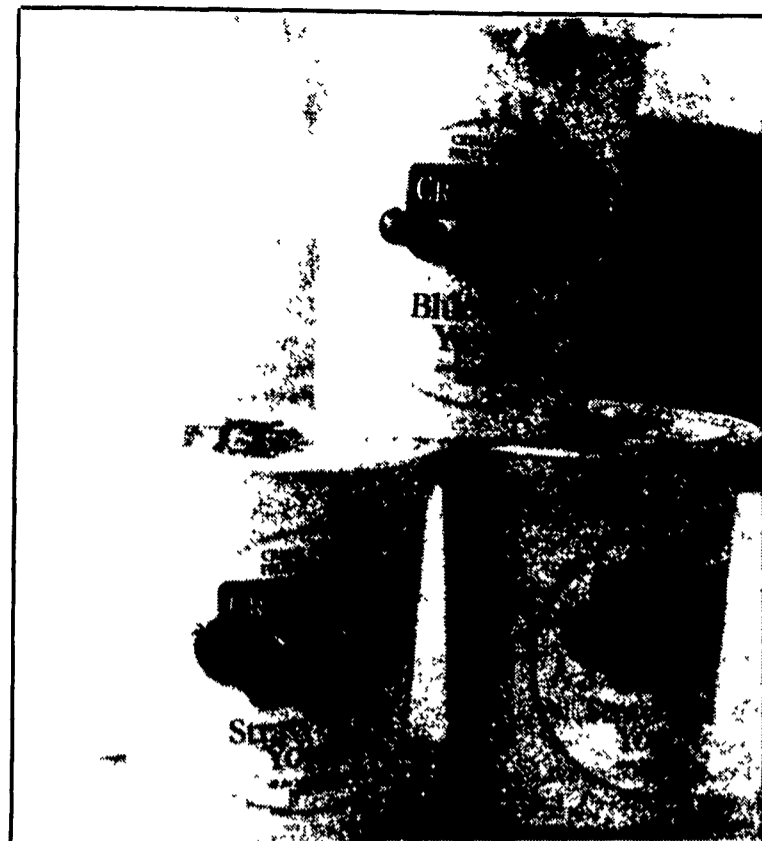
The cooperative's brand name, Cream Lake, originated because of the wholesomeness of the products. According to Graybill, the products emphasize full-flavor nutrition from whole milk dairy products.

In addition to selling their "Cream Lake" products at the retail store, the cooperative will market them into elite grocery