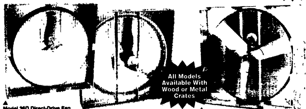
Model 360 Direct-Drive Fan is a 36-inch (914-mm) diameter crated fan with protective screens. This fan has a powerful air flow pattern and features an economical, heavy-duty motor. It is ideal for either hanging or sidewall applications.