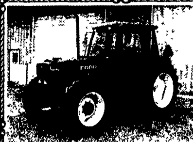
Ford 8240 SLE, cab, air, 4WD, 18.4x38, 750 hrs

Exit 31, I-80 to I-180 Watsonstown Exit Hours: Mon-Fri 8 to 5 Sat 8 to 12